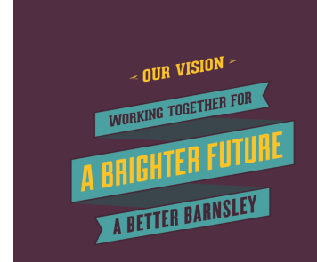
Figure 3: Our Public Health Strategy at a glance